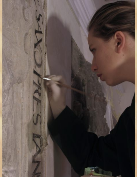
Fig.: 21-25.: Memorial before and after cleaning and conservation.