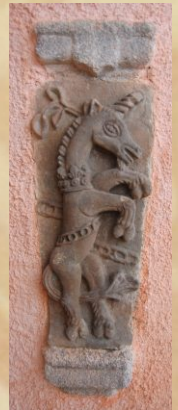
Fig.: 18-20.: Relief carving before and after cleaning and conservation.