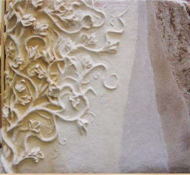
Fig. 86.: Example of partering. Made using lime mortar and then limewashed.