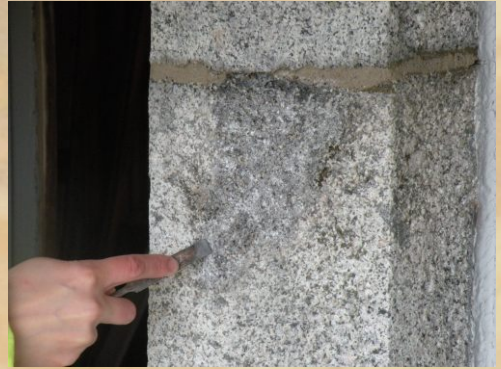
Fig. 40.: Ardverikie lodge.

Fig. 41-43. Granite repairs. Works including inserting stainless steel armatures. Resin and lime grout injections. Acrylic and polyester based mortar repairs.