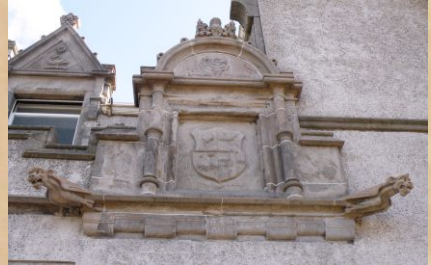
Fig. 3-4.: Wall memorial before and after conservation