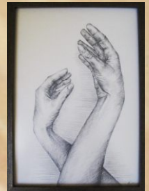
Fig. 92.: Drawing. Pencil on paper. Size-A4.