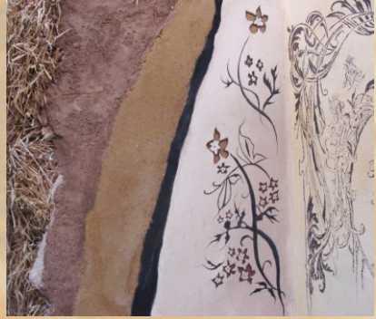
Fig. 87.: Sgraffito. Eco friendly decoration, made on strawbale.