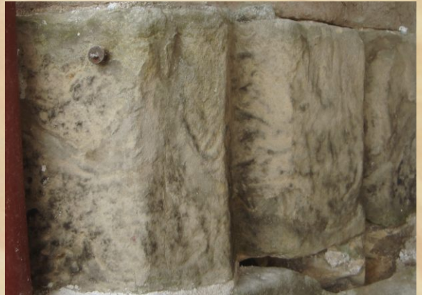
Fig. 68-72.: Responsible for lime mortar repairs on the Crown Tower of King's College . Leading a small group of conservators.