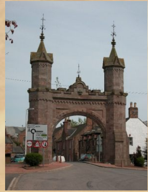
Fig. 73-75.: Fettercairn Arch: Responsible for the lime mortar repairs and stone consolidation.