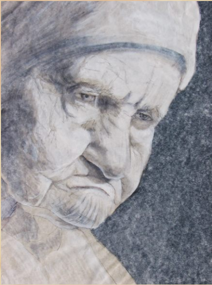
Fig. 88.: Example of portrait drawing. Pencil and ink on paper, size-A3 .