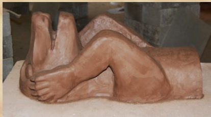
Fig. 90-91.: Clay model of a new working gargoylle for Craigievar Castle.