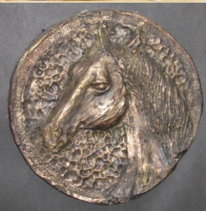
Fig. 98-99.: Medallion with a horse, brass imitation.