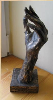
Fig. 96-97.: Two of the series of hand casts, brass imitation.