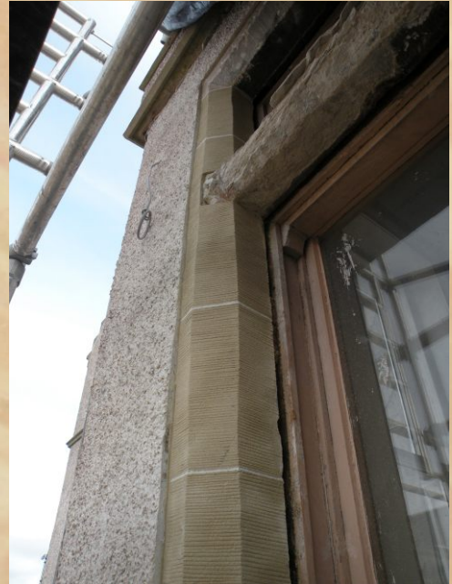
Fig.: 28, 29.: Nairn; Reconstruction based on Lithomix. Repair was matched to the new stones replacing the transoms and mullions.