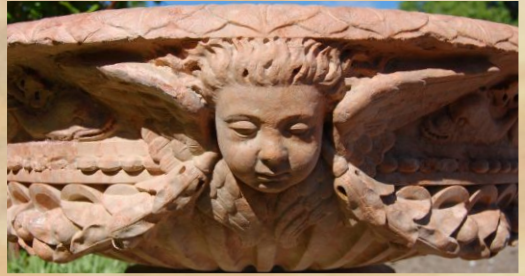
Fig. 34-35.: Conservation of decorative piece of marble.