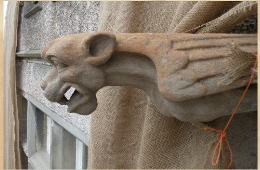
Fig.: 10-11.: Gargoyle before and after cleaning and conservation.