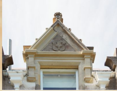
Fig. 1-2.: One of the pediments: pediment with shield and stags head. Before and after conservation. (Stones cut by the stone mason)