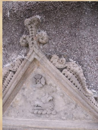
Fig.: 12-13.: Tympanum before and after cleaning, conservation and reconstruction.