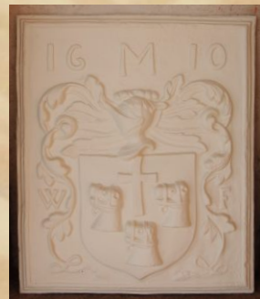
Fig. 38-39.: Making the mould and casting the copy of one of the plaster decorations.