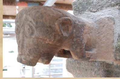
Fig.: 14-15.: Gargoyle before and after cleaning and conservation. Chin of the gargoyle was re-attached.