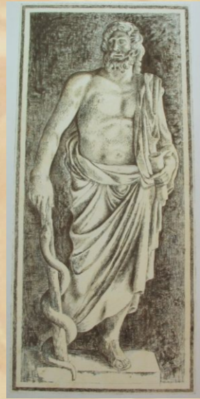
Fig. 89.: Sgraffito, Medical University, Poland. Size approx 100cm x 200cm.