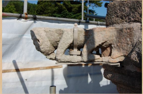
Fig.: 16-17.: Gargoyle before and after cleaning and conservation. Phosphor bronze armatures were applied to support the fragile stone.