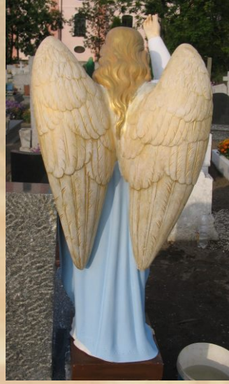
Fig.: 30-31.: Conservation and restoration of ceramic sculpture of an angel. Works included removal of more than 10 layers of oil based paint, reconstruction of fingers, painting the figure with weather resistant water based paint.