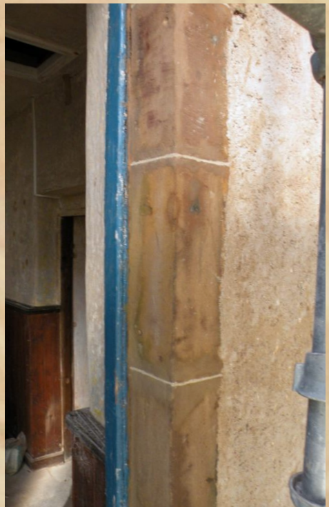
Fig. 64-67.: Lime mortar repairs on window and door surrounds.