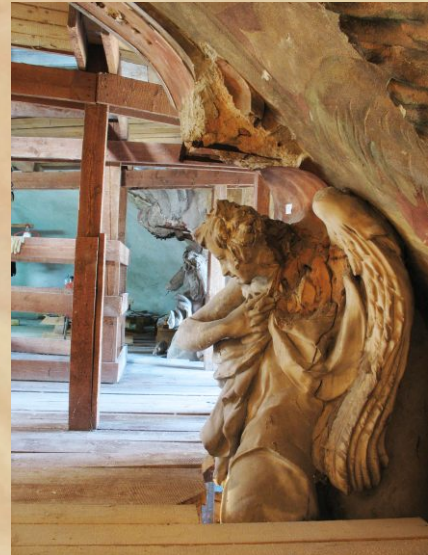
Fig. 55- 59.: The chapel was seriously damaged during second World War and also because of the fire in XIX century. Most of the stuccos appeared to be hollow and de-attached from the disintegrated plaster and brick wall. Stucco preservation including injections of silanes and grouting. Photographic documentation of the entire chapel form the inside.