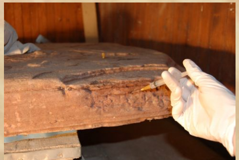
Fig. 60-63.: Conservation of XIV century Tombgrave including: steam cleaning, desalination, consolidation of delaminations using solutions of Paraloid B72 mixed with acetone and IMS (methanol), acrylic mortar repairs, Base making to provide firm and even support for the stone.