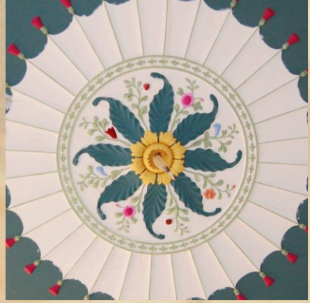
Fig.: 78,79.: Crack consolidation and re-painting of the damaged ceiling rosetta.