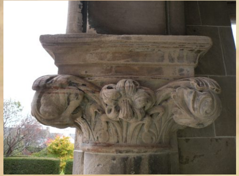
Fig. 8-9.: Capital before and after cleaning and conservation.