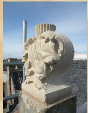
Fig. 5-7.: One of the finials. Because the stone was in such a bad condition it was decided to replace it. However the old stone was conserved and kept as a garden feature. New stone was carved by Karolina Kubisz.