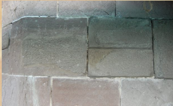
Fig. 76-77.: Dingwall Town Hall Balcony. Conservation of the main part. Report with recommendations how to proceed with each stone, Steam cleaning, removal of old resin repairs, consolidation of delaminations, acrylic mortar and lithomix repairs, inserting stainless steel armatures into delaminating stones.