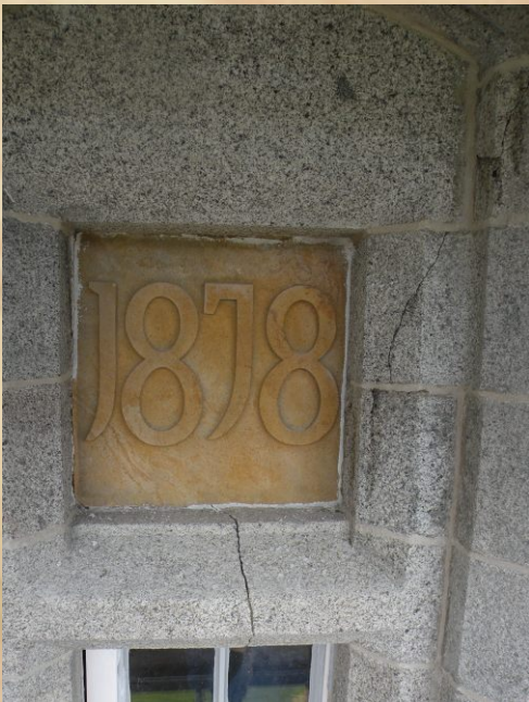
Fig. 41-43. Granite repairs. Works including inserting stainless steel armatures. Resin and lime grout injections. Acrylic and polyester based mortar repairs.