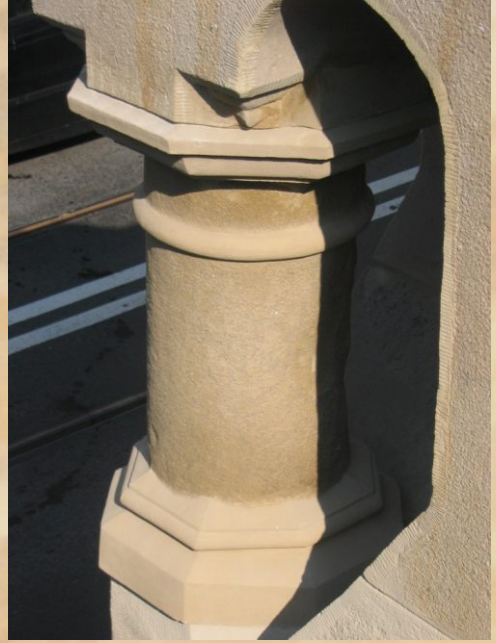
Fig.: 26, 27.: Cracow; Reconstructions made using stainless steel armatures and two ready made mixes by Baunit and Remmers, upper part mixed with Remmers Hafffest for better adhesion.