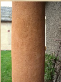
Fig. 80-82.: Lime and white Portland cement pigmented render imitating sandstone of warm colour.