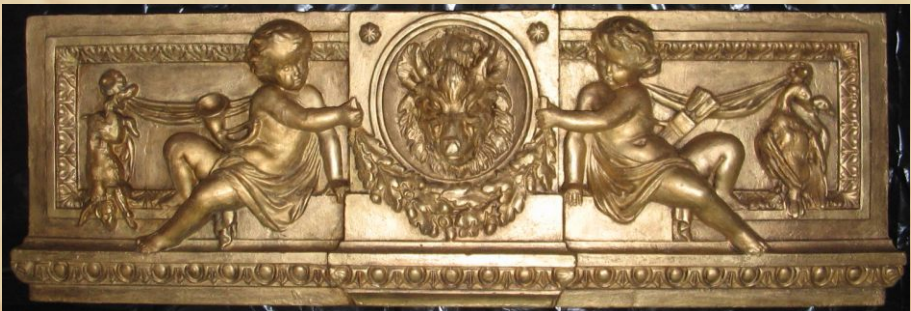
Fig.: 32-33.: Rysiowice Castle. Gilded ceramic tile from fireplace. Works included removal of many layers of paint and cement from the back, gluing the pieces together, reconstructions, gilding.